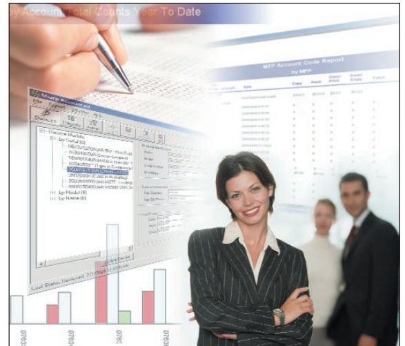
Easy-to-use software enables you to develop device profiles, set costs, and generate valuable reports.

Complement your Digital IMAGER with SharpAccountant, Sharp's powerful tracking and analysis software.